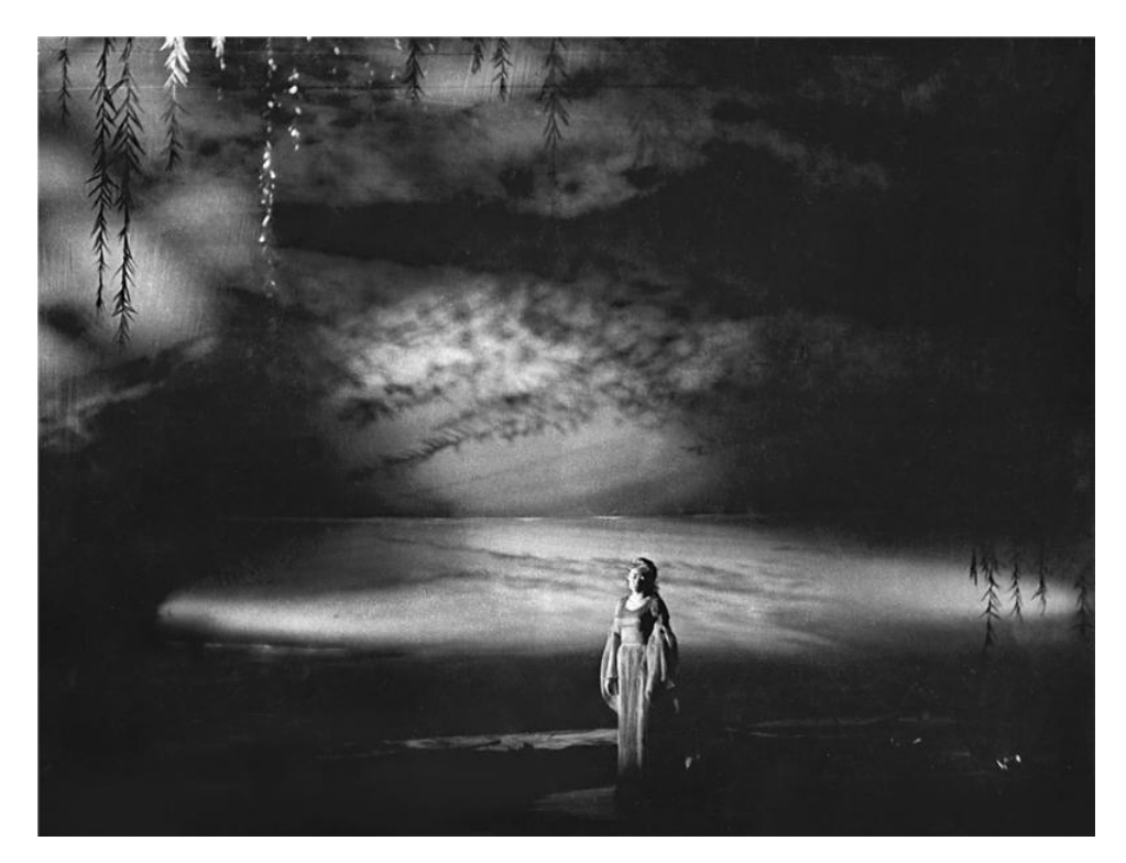
Figure 5.2: Rusalka in Prague, 29 January, 1960.<sup>243</sup>