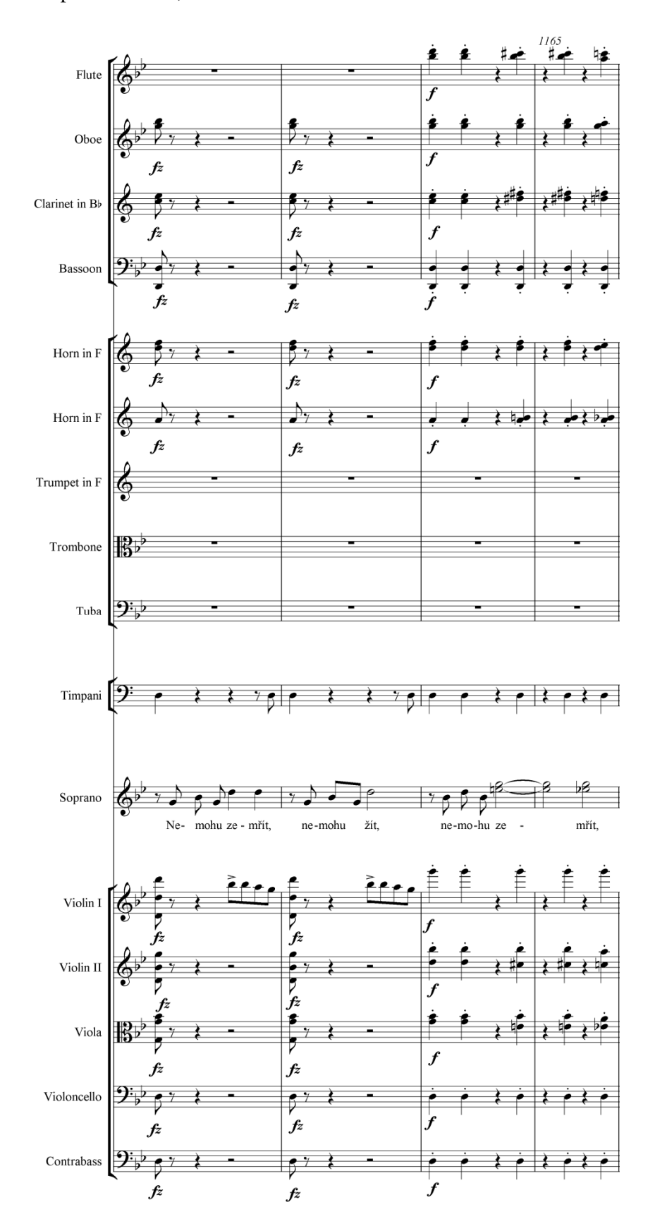
Example 4.8: Act II, bb. 1162 – 1170