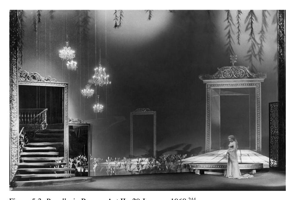
Figure 5.3: Rusalka in Prague, Act II - 29 January, 1960.<sup>244</sup>