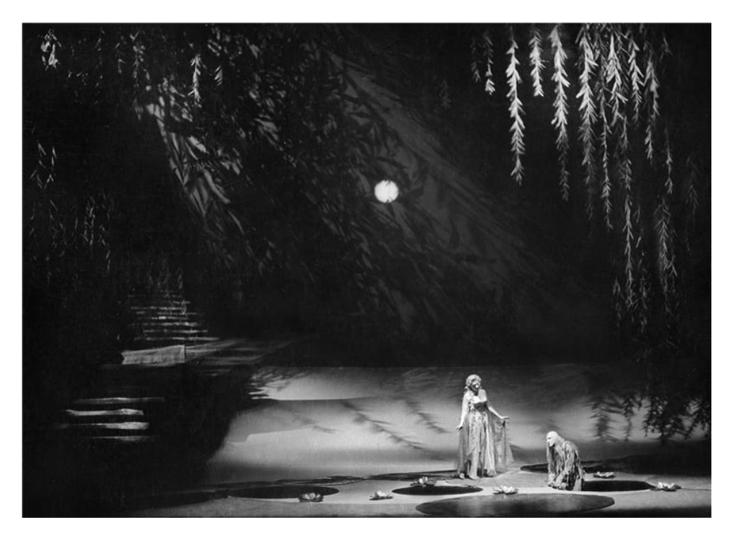
Figure 5.1 Rusalka in Prague, 29 January, 1960<sup>241</sup>

description of tongue-cutting. Additionally, Tatar makes an interesting point while discussing the Grimm brothers' fairy-tales: that reading the original fairy-tales is sometimes an 'eye opening experience' for adults, due to the 'graphic description of murder, mutilation, cannibalism, infanticide and incest'. The greatest shock of all seems to be the fact that they were intended for children. A parallel could be drawn here: watching the modern productions of Rusalka could be seen as an eye-opening experience for adults, since they go to see the opera expecting a Disneyesque setting.